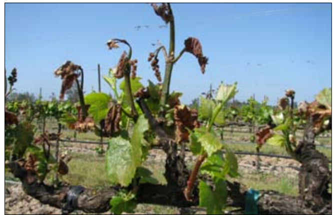
Figure 4. Frost damage.

Distinguishing from SSS Usually, shoot scarring (Figure 2) is not seen in vines damaged by herbicide.