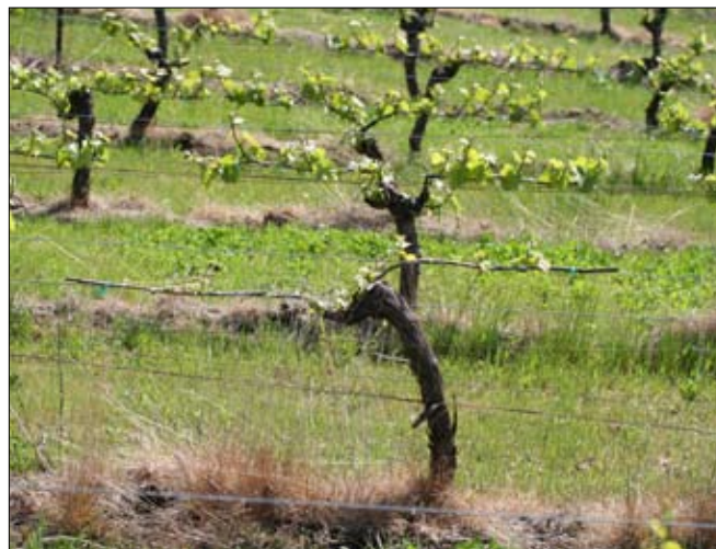
Figure 11. Random bud failure due to cane borer damage (Sherwood, Oregon).

Good cultural practices—such as removing vineyard pruning wood, wood piles, and secondary hosts—will reduce populations. Burn and chop refuse early in the season before adults become active and disperse to the vineyard. Incorporate wood-chip residue into the soil or compost it before adults emerge. For more information on this pest, see the current-year Pacific Northwest Insect Management Handbook ( http://pnwpest.org/pnw/insects ).