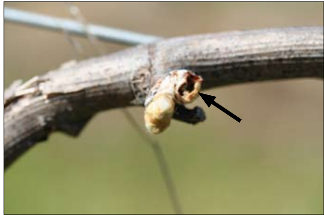
Figure 10. Close-up of bud damaged by cane borer (arrow).