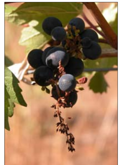
Figure 6. Herbicide damage has reduced fruit set in this cluster.