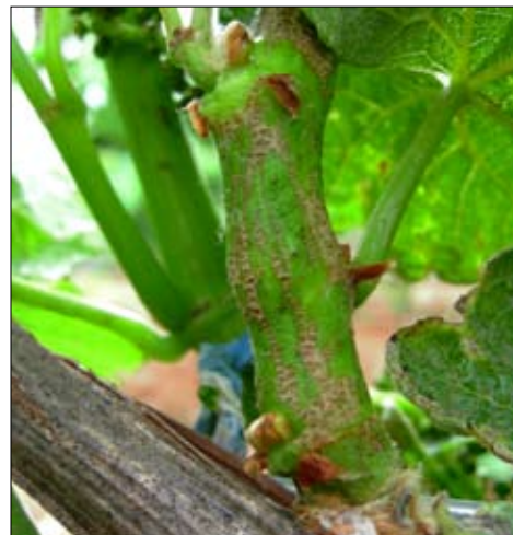
Figure 2. Scar tissue due to feeding by thrips or mites early in the growing season.