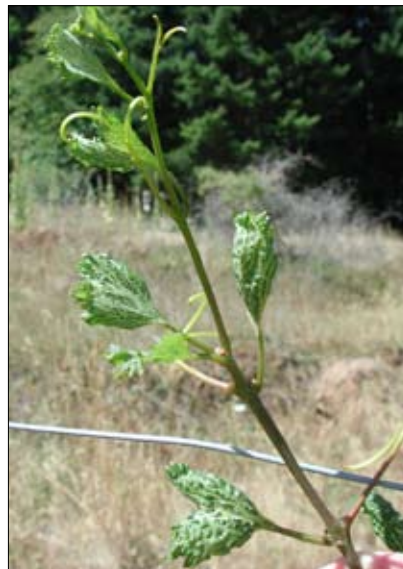
Figure 5. Herbicide damage caused by early-season phenoxy herbicide application. Scarring is not present.