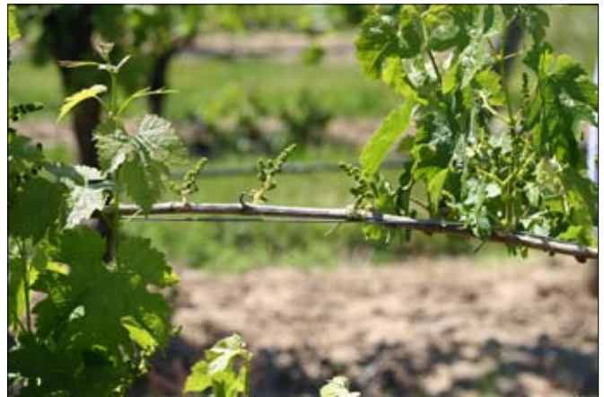
Figure 7. Vine imbalance. Overcropping can lead to bud failure, as seen on this Merlot vine. Note flowers with little or no leaf area. These flowers will not set fruit, resulting in blank areas of the cane or cordon. These symptoms are usually uniform throughout the affected areas.

If you suspect micronutrient deficiency, collect and analyze vine tissue samples. This is usually done with petiole samples collected at bloom or before veraison. Tissue analysis can confirm the diagnosis and allow you to develop a vineyard fertilization plan to correct the deficiency.