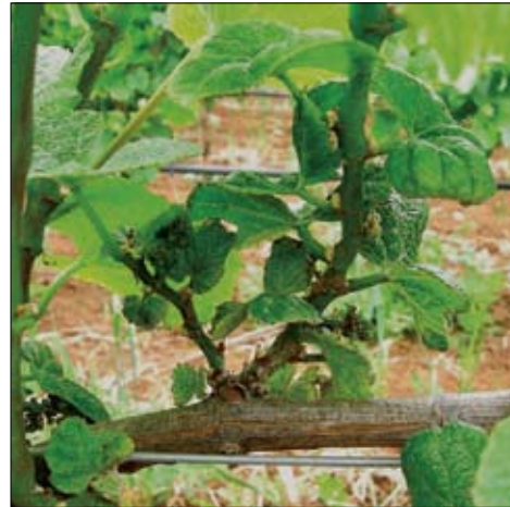
Figure 1. Shortened internodes and cupped leaves characteristic of SSS.