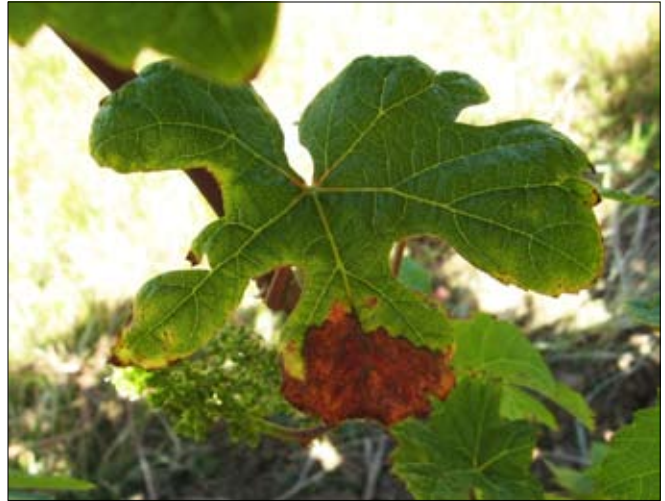
Figure 9. Boron toxicity. Note the cupped leaves and wide leaf sinuses.