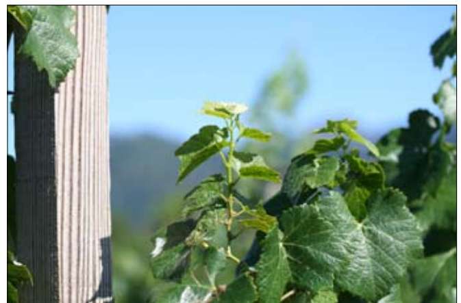
Figure 8. Shortened internodes and small leaves due to B or Zn deficiency.