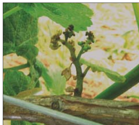
Figure 3. Flower and fruit clusters damaged by SSS.